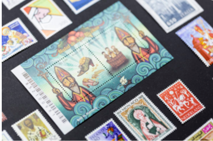
"Munbam" Stamp Collection, Photo, Myrabilia

reverence across the world and his transformation into Santa Claus." A large wall map indicates the countries where St. Nicholas is revered: Argentina, Belgium, Croatia, Finland, France, Georgia, Germany, Hungary, Ireland, Italy Liechtenstein, Luxembourg, Poland, Romania, Russia, Slovakia, Slovenia, Switzerland, Turkey (his birthplace), Ukraine, United Kingdom, and the United States.