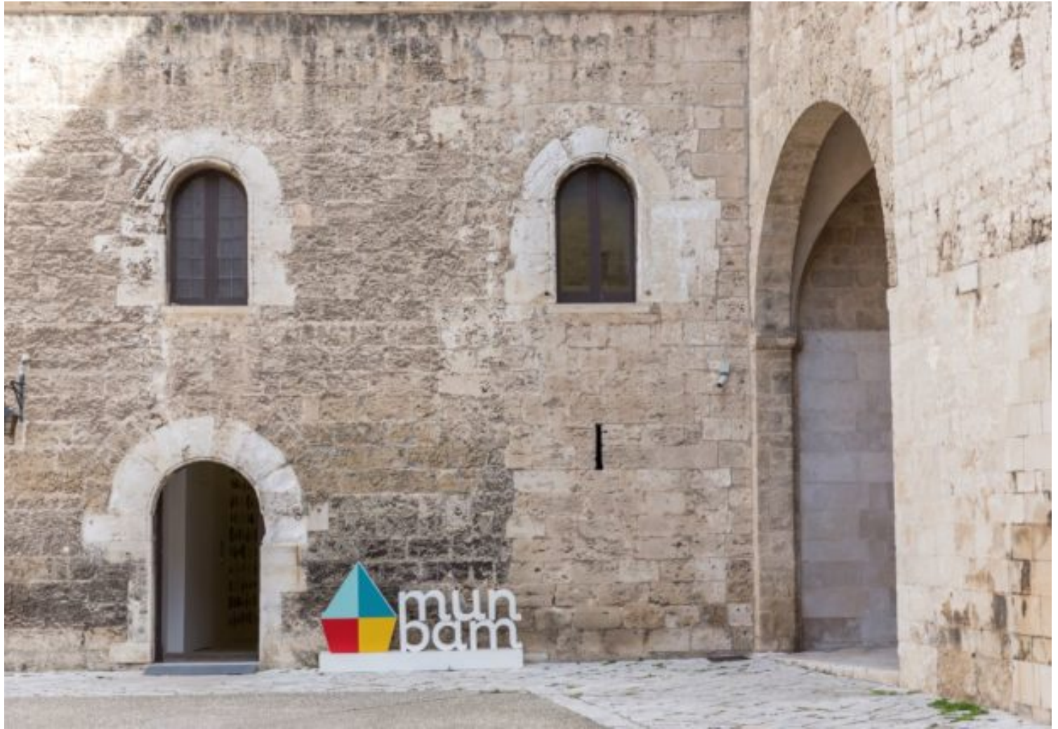
"Munbam" Museum.