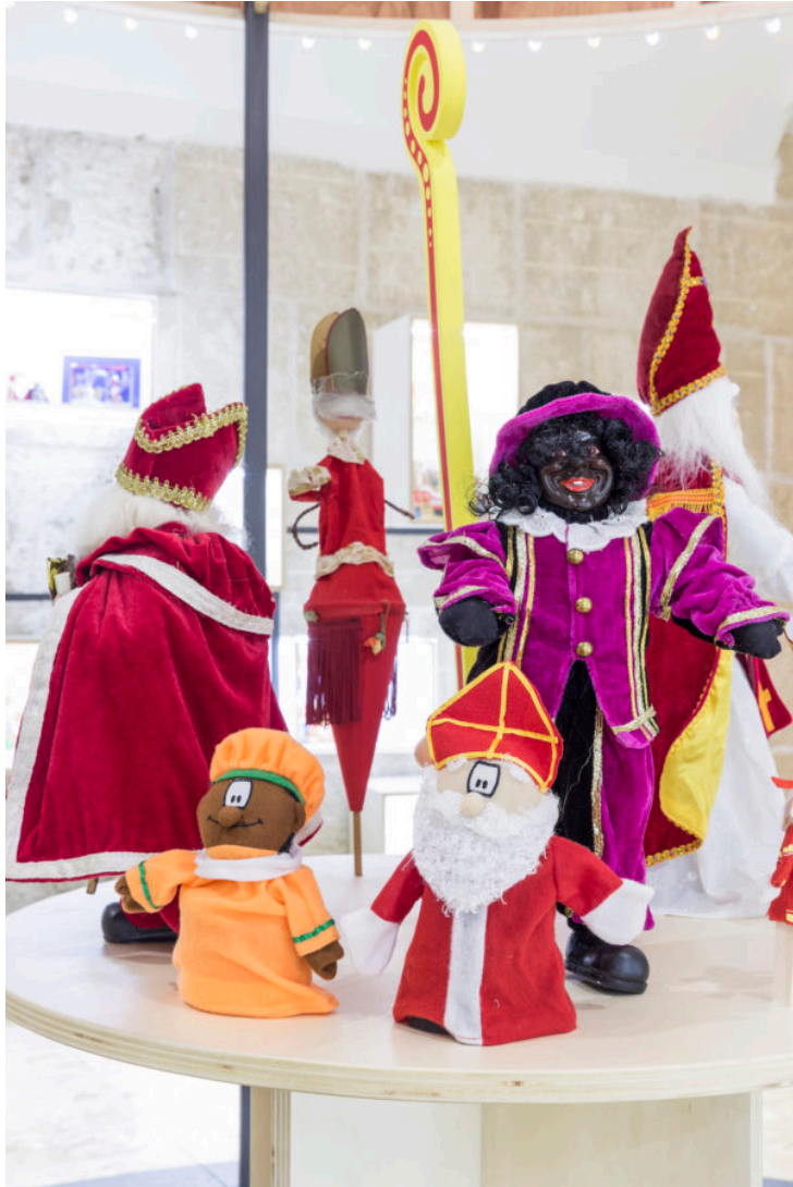
"Munbam" Museum Puppets.