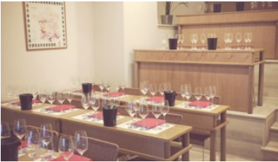
January 21 Wine News: From Vatican City and Rome