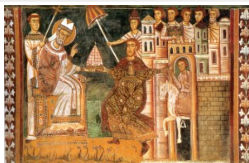
Pope Sylvester I and Emperor Constantine

New Year's Eve is Saint Sylvester's Night. If an east wind is blowing, it promises a calamitous next twelve months. Roman-born Pope Sylvester I was pope from January 31, 314 to his death on December 31, 335. He is buried in Rome's Catacombs of Priscilla.