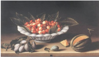
PAPAL GASTRONOMY SINCE ST. PETER