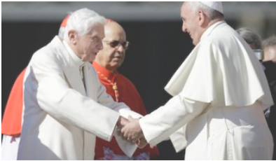
The Vatican's Brand New Tourist Attraction