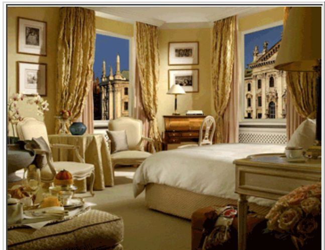
A deluxe room in the Königshof