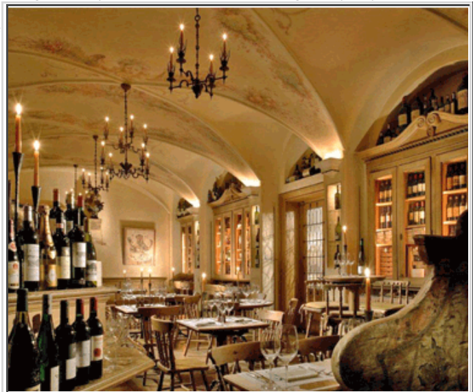
Geisel's Vinothek in the Excelsior