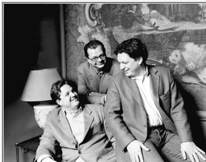
The Geisel brothers