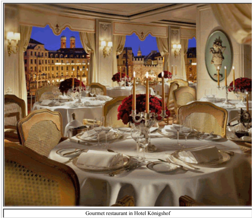
Gourmet restaurant in Hotel Königshof